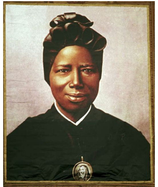
St. Josephine Bakhita